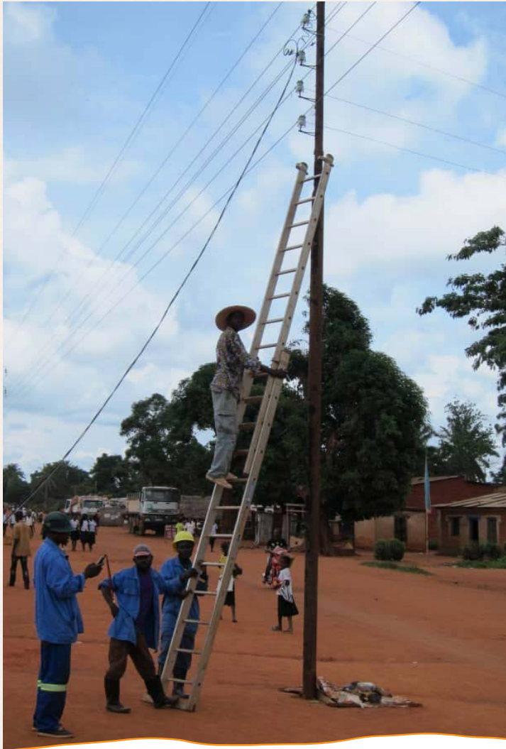
ELKAP: Electricity for Kapanga Provision of green electricity for 1000 institutional, commercial and private clients