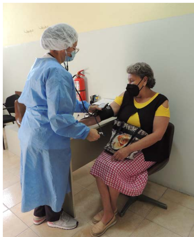
General Medical Care, Catia Slum, Venezuela