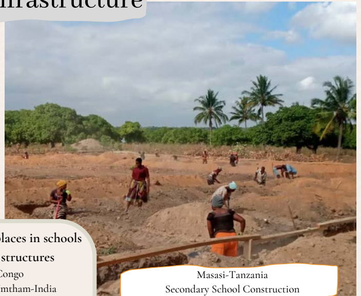
Masasi-Tanzania Secondary School Construction