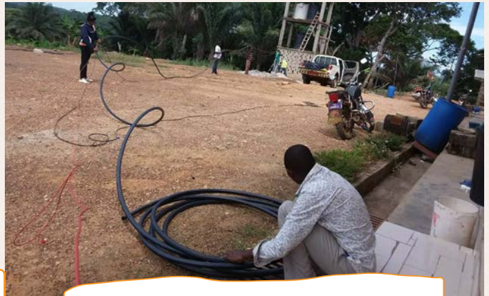
Water project, Cameroon