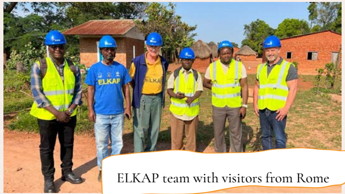
ELKAP team with visitors from Rome

SOFIA supported sustainability projects: