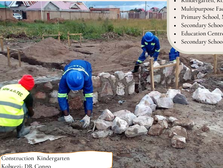
Construction Kindergarten Kolwezi- DR Congo