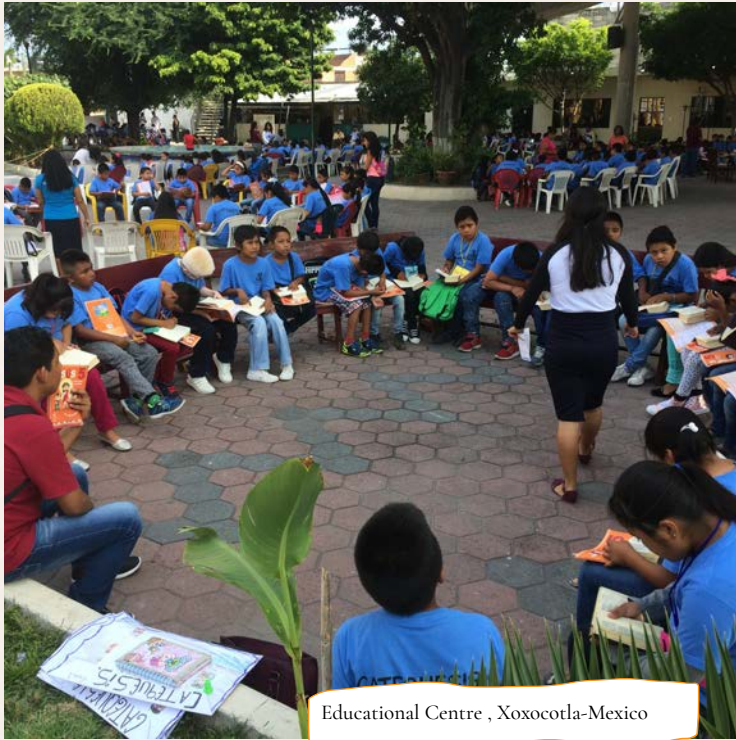
Educational Centre , Xoxocotla-Mexico

Dear well-wisher, benefactor, supporter, confrere,