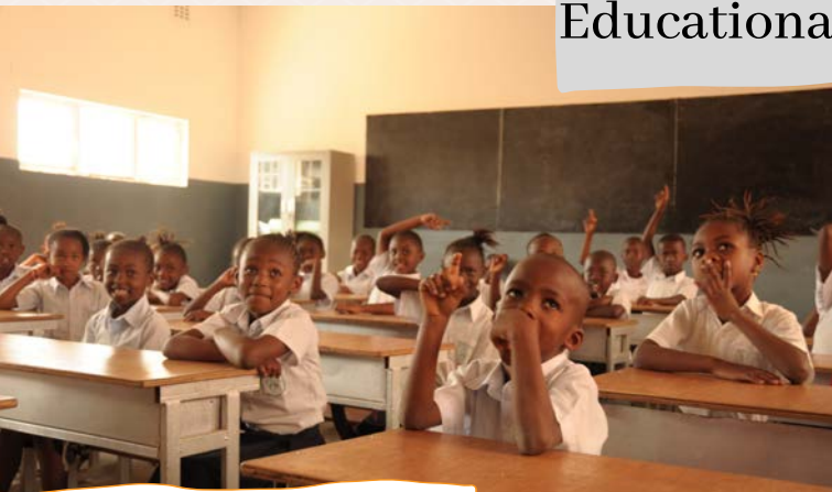
Wokovu, Lubumbashi-DR Congo School Complex Continued Expansion