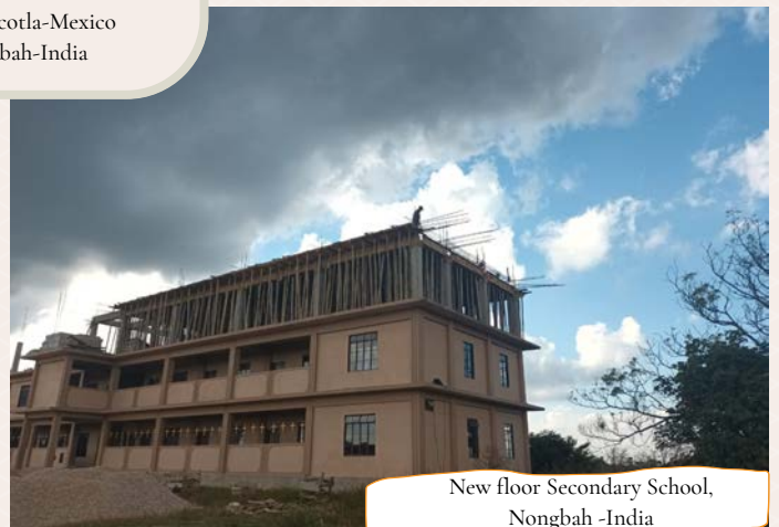
New floor Secondary School, Nongbah -India