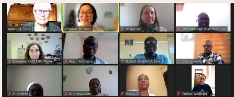
Participants of M&E Workshop

SOFIA organized 2 online Capacity Building Workshops (M&E and Fundraising & Project Management). 50 Participants from 20 Countries