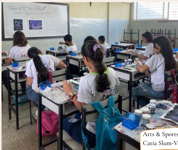
Arts & Sports, Extracurricular Activities Catia Slum-Venezuela